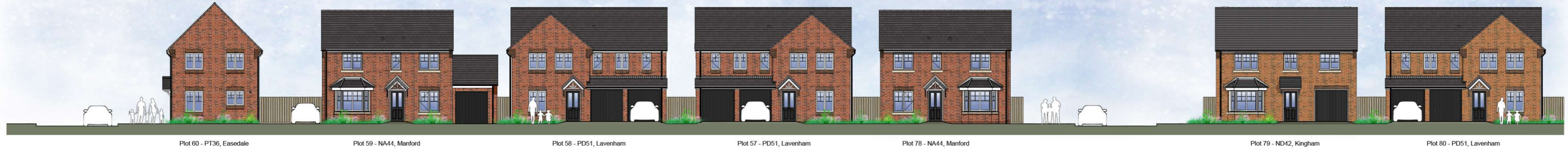
STREET SCENE C-C @ 1:200