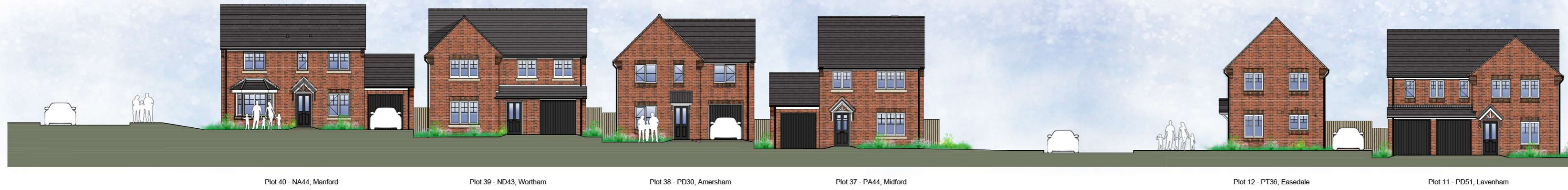
STREET SCENE B-B @ 1:200